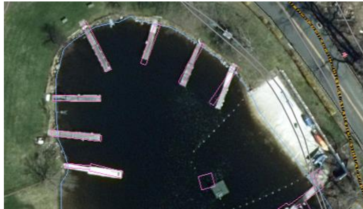
Community Docks, Beach & Swim Area Example