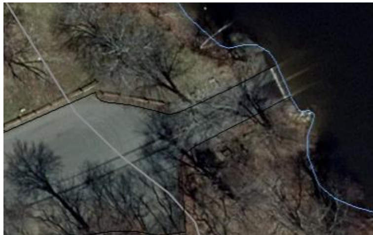
Community Boat Ramp & Parking